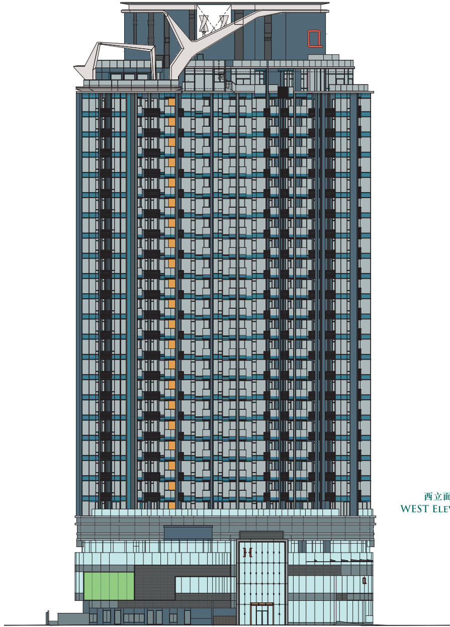
西立面圖 WEST ELEVATION