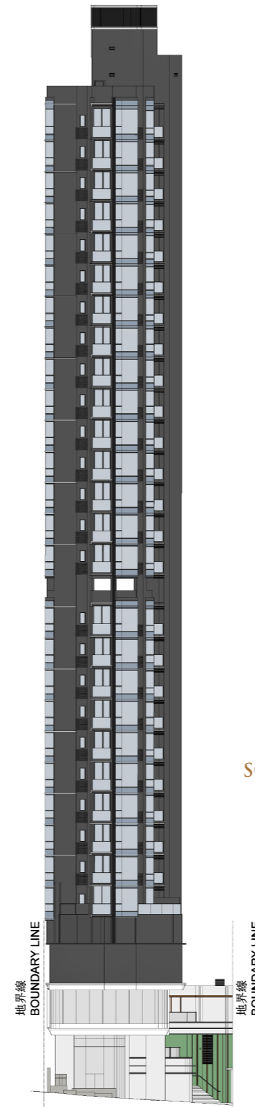
東南立面圖 SOUTHEAST ELEVATION