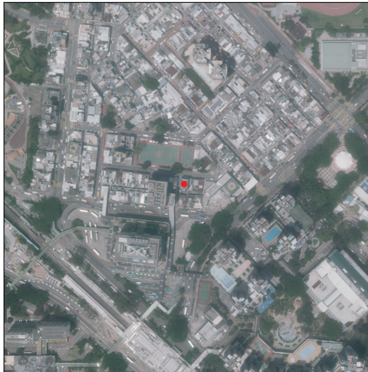
● Location of the Development 發展項目的位置

Adopted from part of the aerial photograph taken by the Survey and Mapping Office, Lands Department at a flying height of 6,900 feet, photo No. E093031C, date of flight : 15 April 2020. 摘錄自地政總署測繪處在6,900呎的飛行高度拍攝之鳥瞰照片，照片編號E093031C，飛行日期：2020年4月15日。