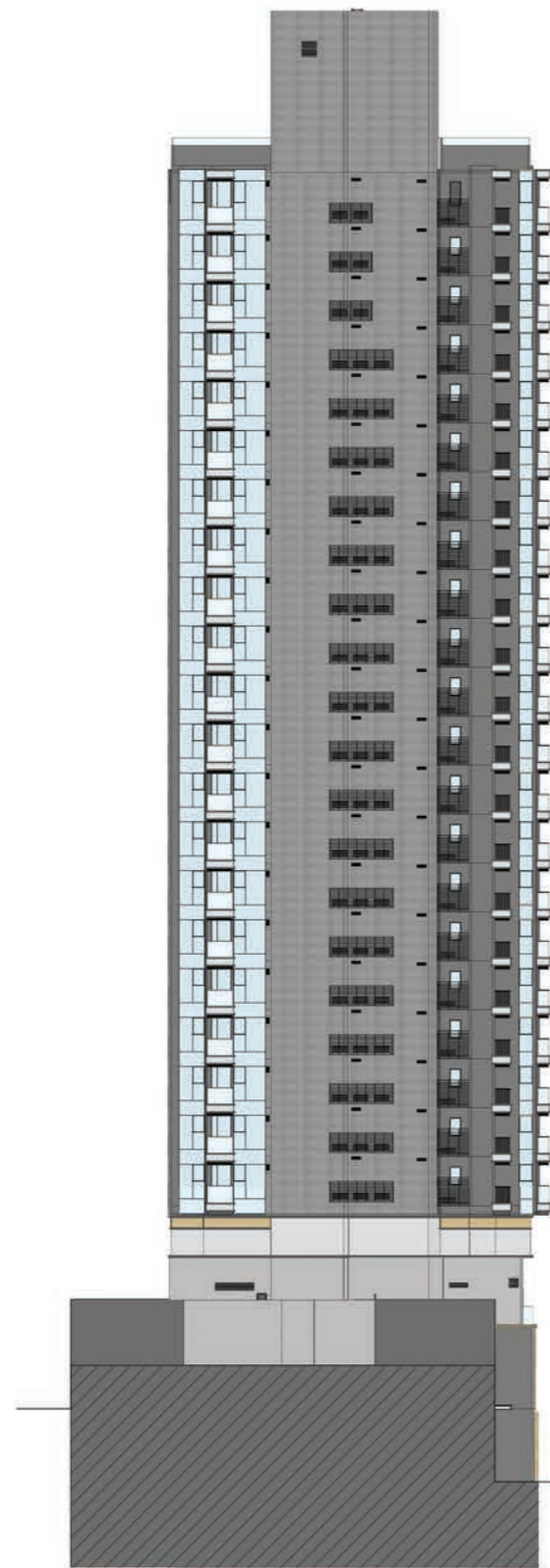
ELEVATION C 立面圖 C