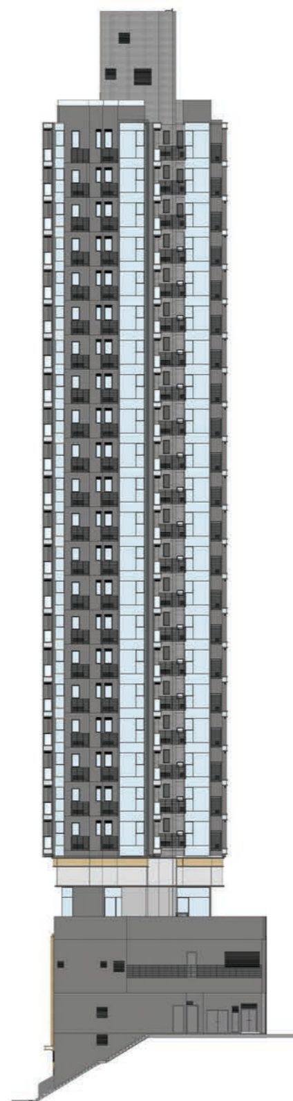
ELEVATION B 立面圖 B