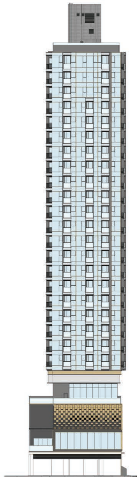
ELEVATION D 立面圖 D