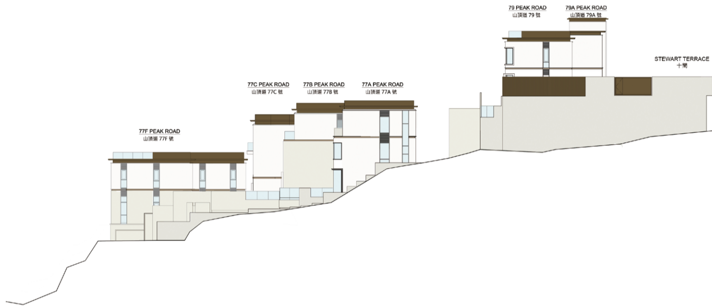
South Elevation 南面立面圖